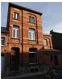
Figure 1 shows some pictures of the volumes and a graphical representation of the global volume of the building.

It has a main volume consisting of a ground floor (hall & staircase, living room and dining room), a first floor with a large space to hold artistic workshops and a second floor that currently serves as an attic. There is a smaller volume to the right (currently unoccupied on the ground floor and a storage room for the artistic workshop on the first floor) and an extension to the back (private office space and small TV space, kitchen and washing room on the ground floor, as well as a bathroom and bedroom on the first floor). There is also a double garage at the back. On the right side, there are two rooms and a small entrance hall, that act today as storage and guest bedroom.