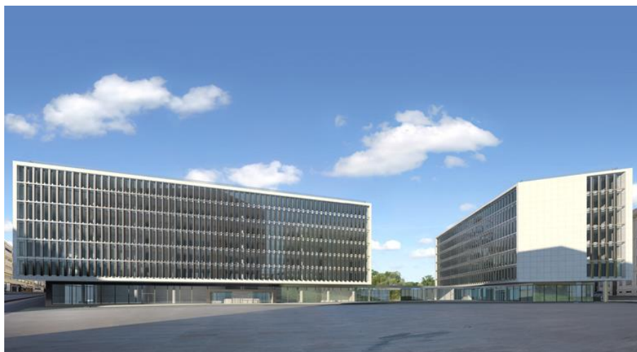
FIGURE 2 - EDP PORTO BUILDING COMPLEX. BUILDING A (LEFT), BUILDING B (RIGHT).

The pilot site is a services building located in the centre of Oporto at an altitude of 86 meters and less than 5 kilometres from the maritime coast. The building complex, composed of two buildings, designated by building A and building B, was inaugurated in 2011 and is one of the two EDP national headquarters, as depicted in Figure 2. For the Portuguese pilot, we will focus our attention on building A due to the availability of monitoring equipment. Furthermore, the COVID-19 pandemic situation significantly reduced the occupancy of building B, resulting in reduced energy needs. Building A has a useful floor area of 18,655 m 2 and normal utilization of around 600 people. It is composed of ten floors of which three are underground floors dedicated to parking and technical areas, with 7 EV chargers installed for use by employees, with 8 more planned to be installed. There is a partially automated control of the building's consuming devices, including lighting and Heating, Ventilation and Air-Conditioning (HVAC), although the overall level of smartness of the building can be considered low.